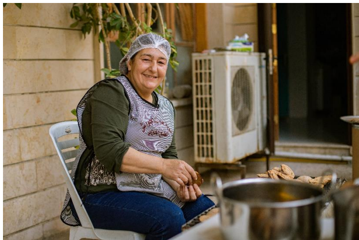
Woman cooking in charity kitchen