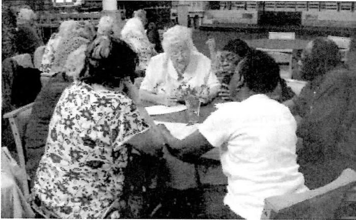
JULY : QUIZ MORNING