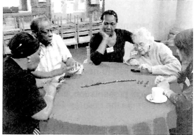
AUGUST: BOARD GAMES - SCRABBLE®, DOMINOES