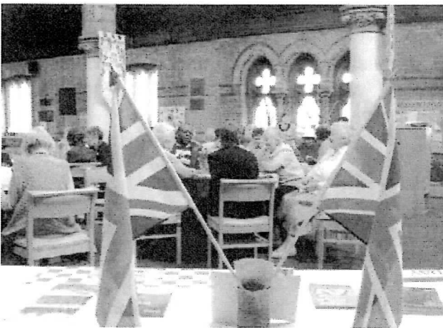
SEPTEMBER: MEMORIES OF THE 1940S