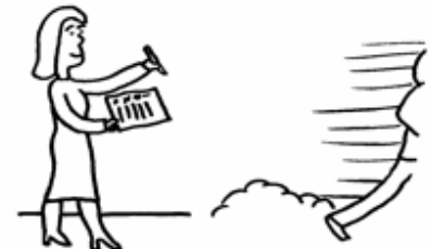
APPROACHING PEOPLE WITH A ROTA