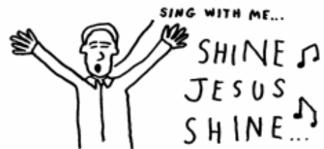
SOME ODD OR UNPREDICTABLE BEHAVIOUR