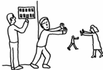
TURNING OUT THE LIGHTS