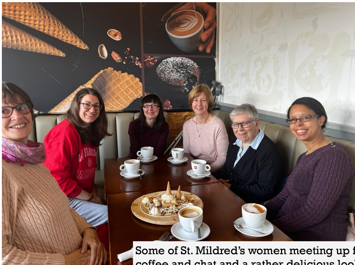
Some of St. Mildred's women meeting up for coffee and chat and a rather delicious looking waffle as a centre piece.