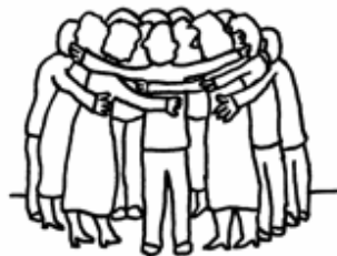
THE COMMENCEMENT OF A GROUP HUG