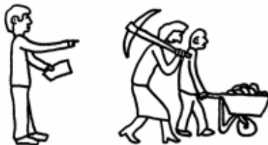
ORGANISING A WORK PARTY